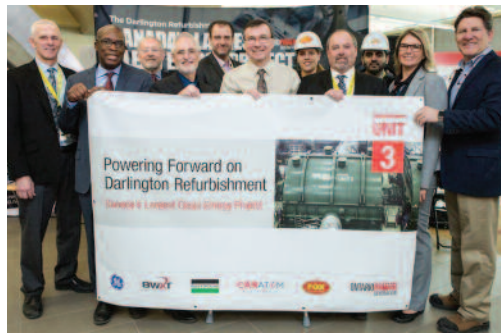
The Ontario government has confirmed its commitment to begin the refurbishment of Unit 3 at Darlington Nuclear

On February 13 th , the Ontario government announced its commitment to begin the refurbishment of Unit 3 at Darlington Nuclear. With this announcement is the celebration of the halfway mark of refurbishing Unit 2. "The Darlington refurbishment will ensure that reliable, nuclear energy continues to be the backbone of our generation fleet," the Minister of Energy stated in a news release. Refurbishment and continued operation of Darlington to 2055 will contribute $90 billion to Ontario's GDP, and increase employment across the province by an average of 14,200 jobs annually, including more than 2,600 jobs onsite at Darlington.